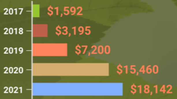
COUNSELING SCHOLARSHIP ALLOCATIONS