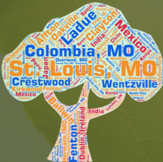
REGIONAL & WORLDWIDE REACH